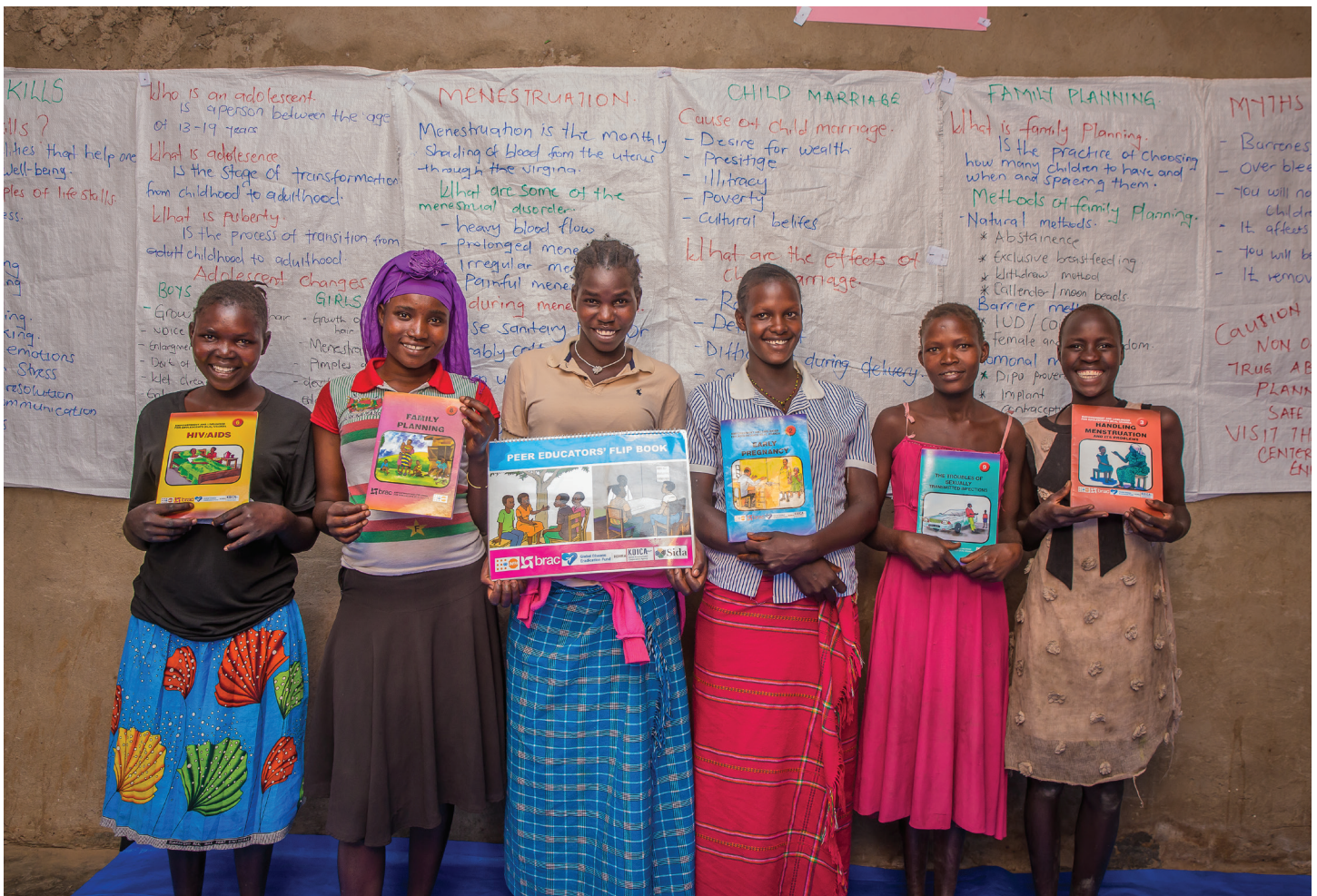
Girls in an ELA club in Uganda show off new life skills books from the redesigned ELA curriculum. Photo: Uganda © BRAC, 2020

Over the past two decades, the development field has seen enormous gains in effective programming for adolescent girls and young women, including through investments in evidence-based approaches such as the Empowerment and Livelihood for Adolescents (ELA) programme initiated by BRAC. BRAC is a leading international nonprofit with a mission to empower people and communities in situations of poverty, illiteracy, disease and social injustice. Randomized evaluations in several contexts have demonstrated ELA's positive impact, which is achieved by delivering empowering and engaging content covering sexual and reproductive health, economic skills and valuable life skills in girls' clubs or safe spaces. The United Nations Population Fund (UNFPA) recognizes BRAC as a leader in the field and a valued partner in its mission. In the spirit of learning, UNFPA, in keeping with its commitment to gender equality and sexual and reproductive health and rights, with a particular focus on adolescent girls, supported this synthesis of lessons learned over the 15-year history of the ELA programme, for the benefit of the wider development community. Note that the views expressed herein can in no way be taken to reflect the official opinion of UNFPA.