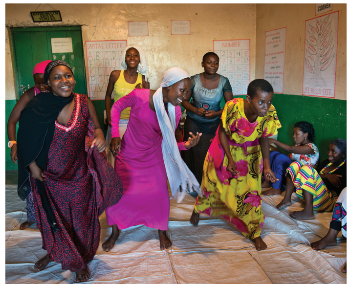
Girls at an ELA club in Tanzania sing and dance together.

In 2018, BRAC convened senior ELA staff from several countries to assess what factors might have contributed to the programme's poor participation rates. 29 ELA staff members cited ELA's curriculum, which was seen as dated and rote; the time commitment expectations of participants, which made it difficult for participants to attend each session; the wide age-range of participants in the same club; the lack of a graduation model, which kept some participants in the programme for years; and the need for more robust monitoring. 30