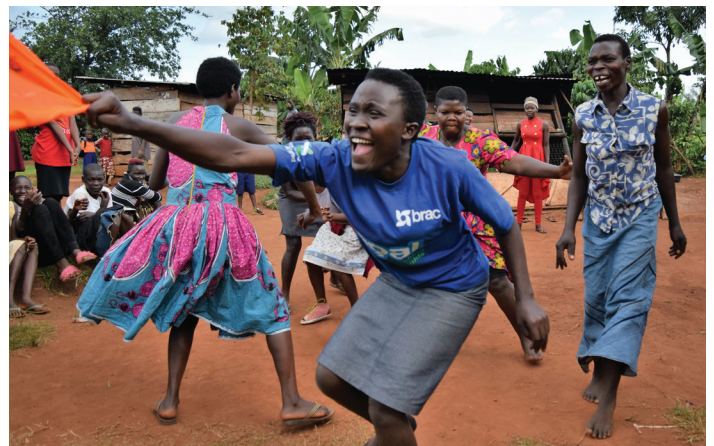
Girls in an ELA club play games outside together.

Once a community is selected for ELA, formal community leadership committees are formed. Working in partnership with ELA staff members, these committees are responsible for ensuring the smooth operation of the ELA clubs. In some areas, ELA staff also form parent committees, which offered an opportunity for parents to gain a deeper understanding of the ELA programme, and to receive more detailed updates on the progress of club participants.