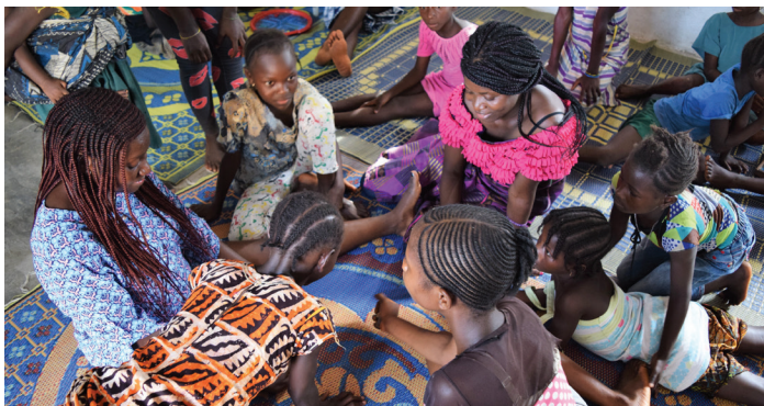
Safe spaces where girls can socialize are a crucial component of the ELA model.

There was a sense that the ELA curriculum had grown outdated over the years. Programme staff described the original ELA curriculum as lacking “in its discussion of sex, gender and reproductive health;” 31 “not always relevant