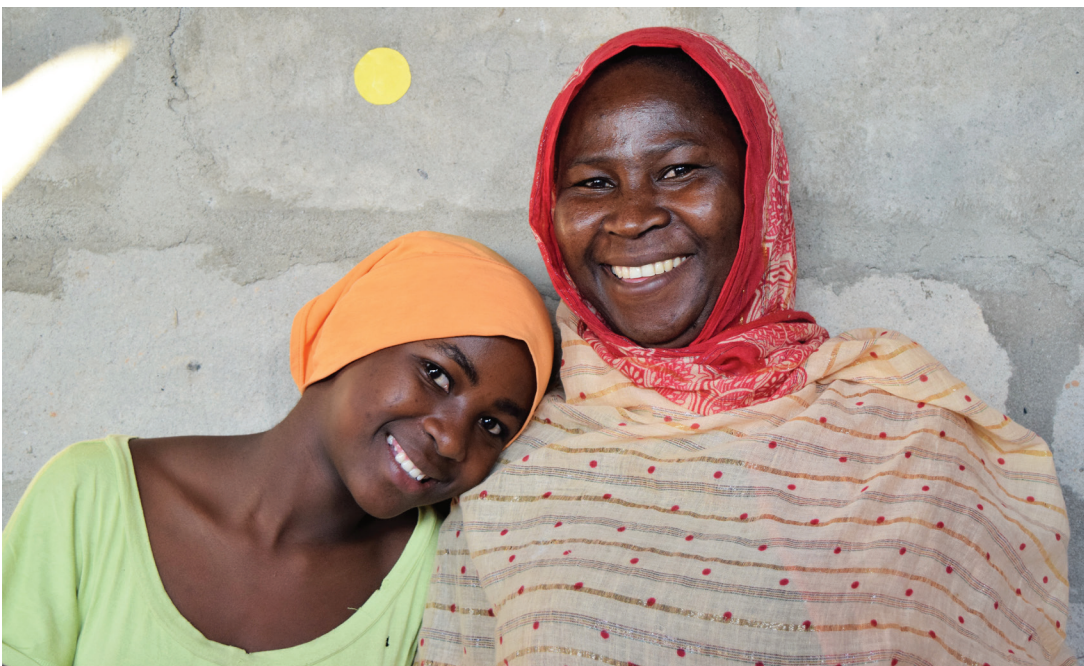
An ELA participant in Sierra Leone with her mother. Engagement with parents is key to the program's success.

As BRAC and others adapt the programme to new contexts and delivery channels, new research will be essential in order to understand what level of programming and which programming components are necessary to achieve impact. This understanding would allow BRAC and others to maximize cost effectiveness and scale for ELA and ELA-like programmes, thus delivering a wealth of opportunities for a new generation of adolescent girls and young women.