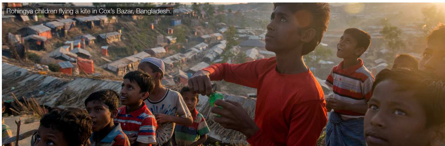
Rohingya children flying a kite in Cox's Bazar, Bangladesh.

Amid competing disasters and humanitarian crises, many refugees have little hope for repatriation and may feel forgotten by the global community. But your support this past year created opportunity and hope for a growing number of displaced people.