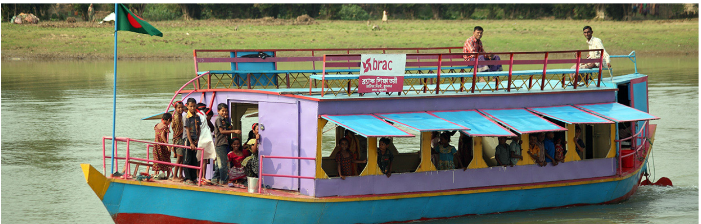
BRAC's "floating schools," are one example of locally-led climate adaptation. This program has received many awards for its innovative approach to accessible education, securing opportunities for children to learn despite unpredictable flooding of schools and roadways from rural dwellings across Bangladesh and the Philippines.